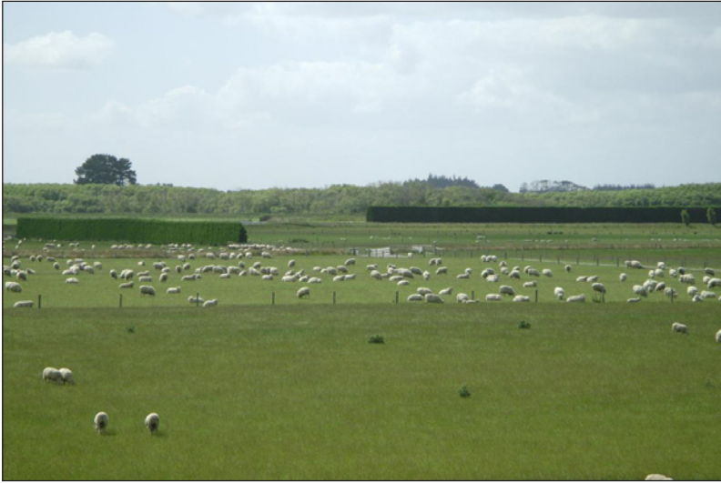
Southland sheep farm for dairy conversion

This year it is expected that 20 farms in both the Southland and Canterbury regions will convert to dairying – mainly sheep farm conversions in Southland, and cropping farm conversions in Canterbury. Dairy cow numbers have expanded to 5 million, and now there are concerns over the continued growth of dairy cow numbers, both in regions where dairying has been the traditional land use and in regions where dairy conversions have occurred. A typical farm with potential for such conversion is shown in the photograph below.