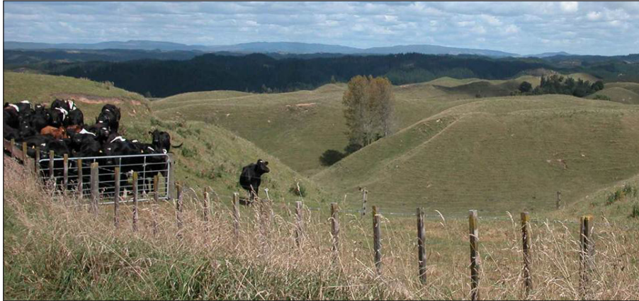
Hill country property

(a) Explain in detail, considering economic and social factors, why farmers on North Island hill country properties continue to farm a combination of sheep, cattle, and deer.