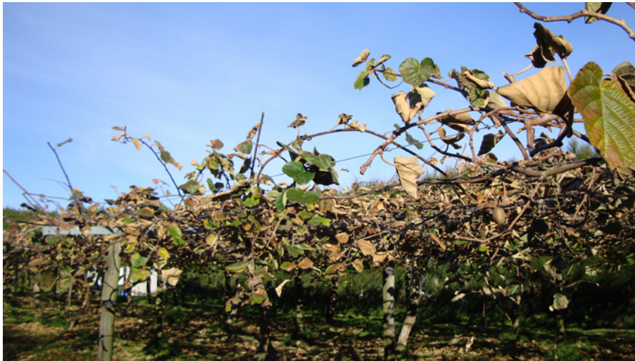
Bay of Plenty kiwifruit orchard

The kiwifruit disease Psa-V has killed vines in the Bay of Plenty, a region that produces 80% of New Zealand's export crop. Experts say that the disease affects nearly 1,000 orchards growing the gold variety, and they expect a 20% reduction in the volume harvested. Affected growers are now considering other forms of land use for their properties.